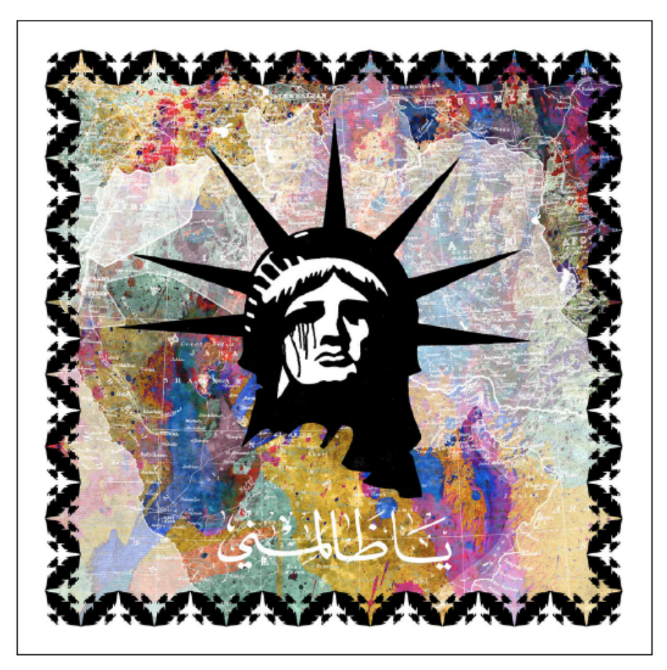
Ya Zalimni, Alfred Tarazi, giclée print, 110 x 110 cm

10th September 2011 Dial 911 for the New Middle East > Alfred Tarazi, Nadim Karam at the Running Horse Art Space (Beirut)