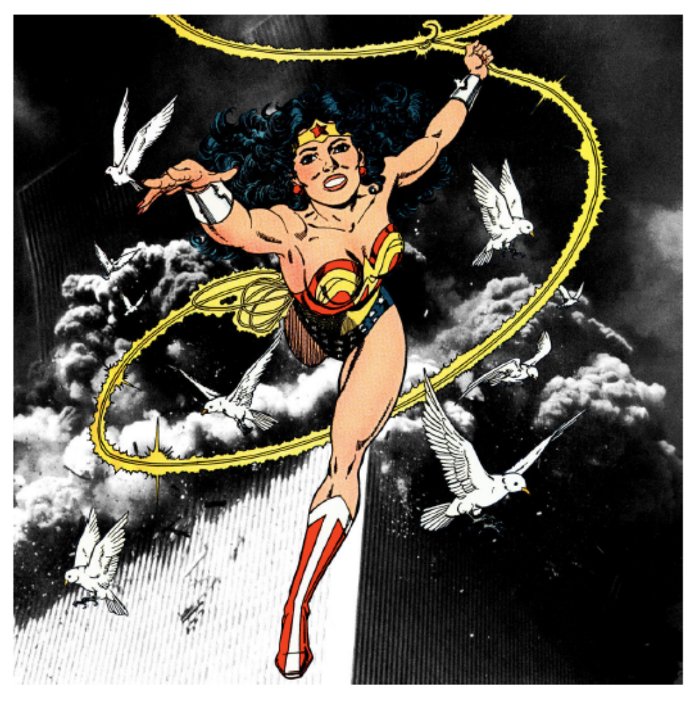
New York, September 11 2001, Alfred Tarazi, giclée print, 100 x 100 cm

[http://3.bp.blogspot.com/-H32wjcwc-uw/TmqDncAD El/AAAAAAAACS8/NYnX9moYLwA/s1600/Picture+3.png]